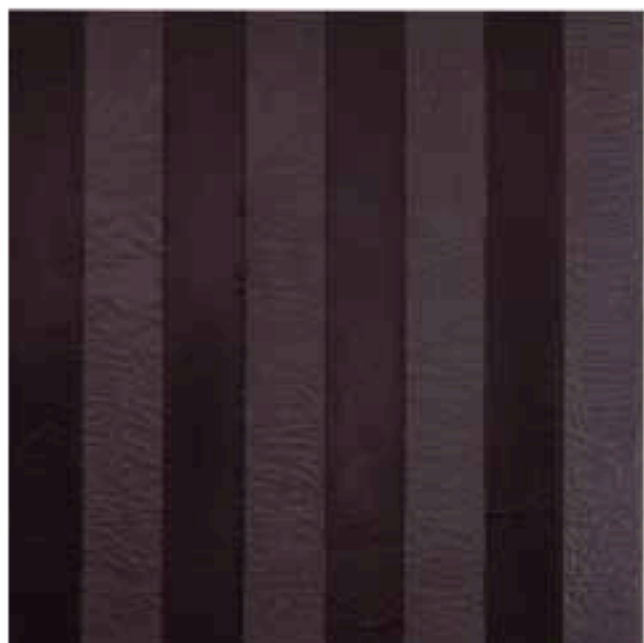
Black Straits, 2008