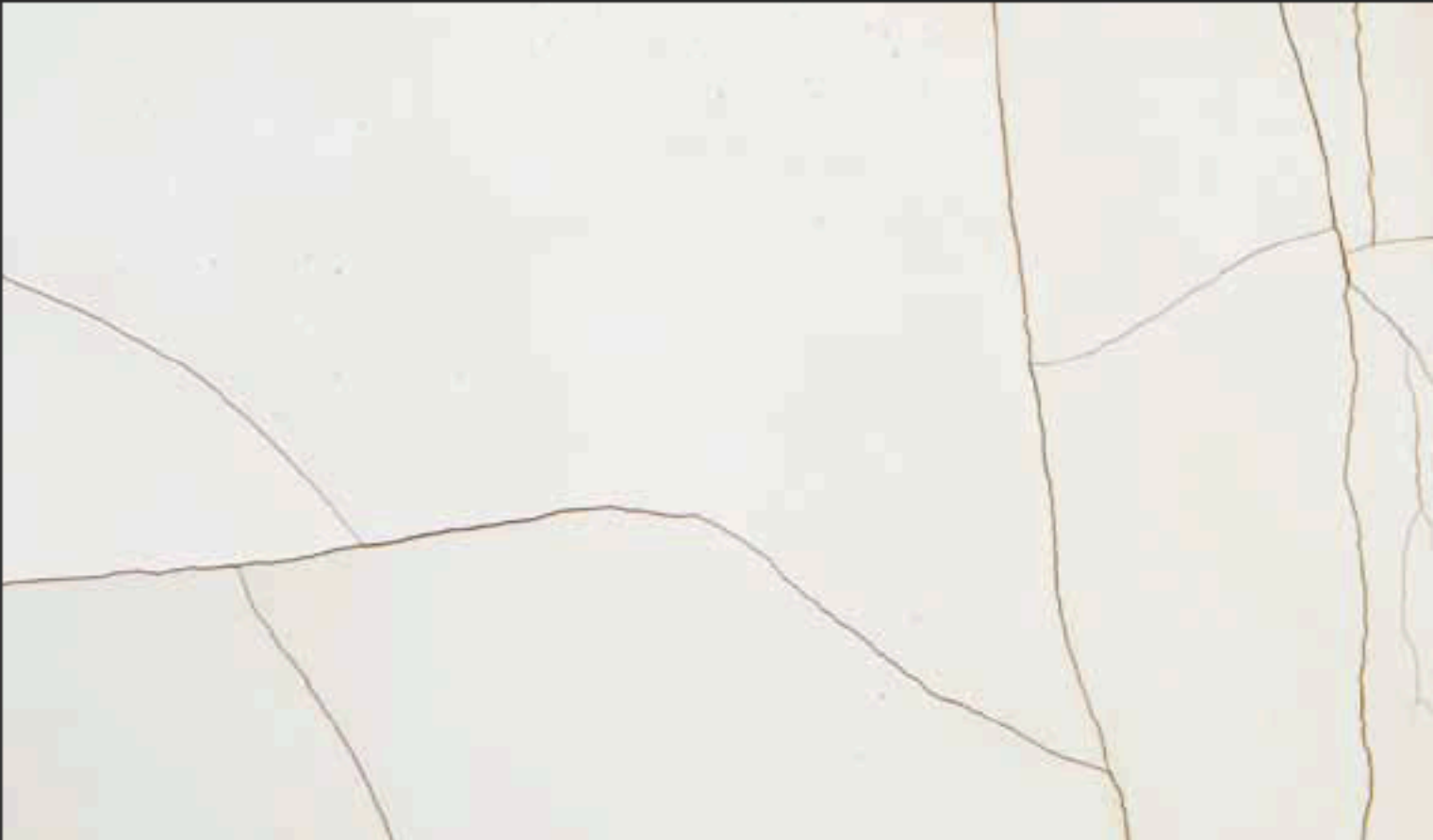
Divided Ground I: Ivory/White detail, 2011